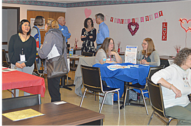
Community members attend the open house at the Retired Tigers Senior Apartments in Warsaw Monday. The open house had tables set up in their community room from different organizations in the area.