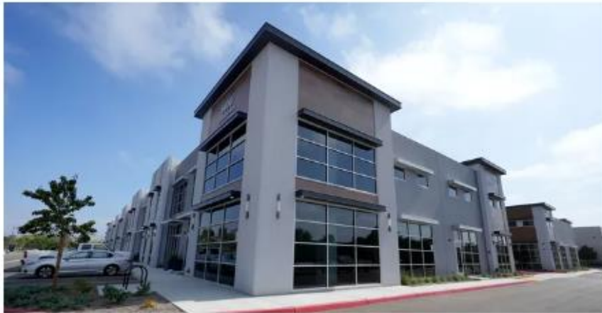
The new Santiago Industrial Suites development in Oxnard put 24 industrial condominiums on a formerly vacant lot at Graves Avenue and Santiago Court, seen Thursday.