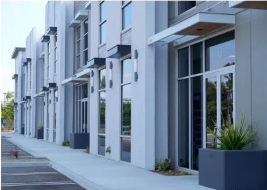
Two new buildings with 24 small industrial condominiums comprise the Santiago Industrial Suites in Oxnard, seen on Thursday. Some of the individual units will be for sale.