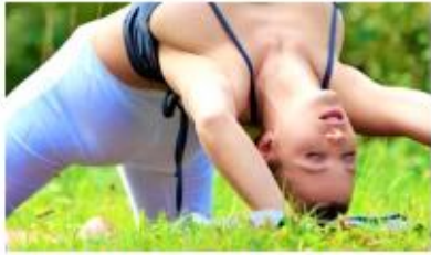
Look Closer: This Pic Was Not Edited

The vote allows the parcel to be divided into nine lots where eight buildings totaling about 40,000 square feet will be built and can be individually sold, according to staff reports . The ninth lot will be a parking lot and common area.